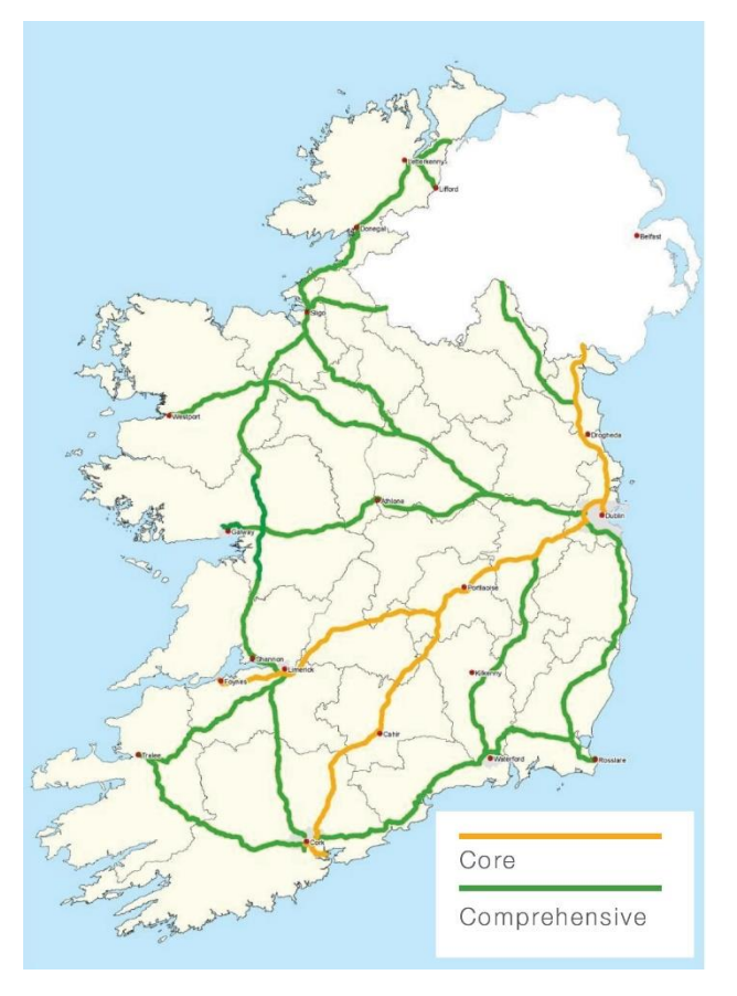
Plate 2.1: TEN-T Network Ireland

The objectives of the proposed road development align with the European Union's land transport policies given that the following targets are among the objectives of the proposed road development, whose targets meet those set out in the EU SDS operational objectives and targets, as set out above (ref: Chapter 3 , Section 3.3 of this report for the Project Objectives):